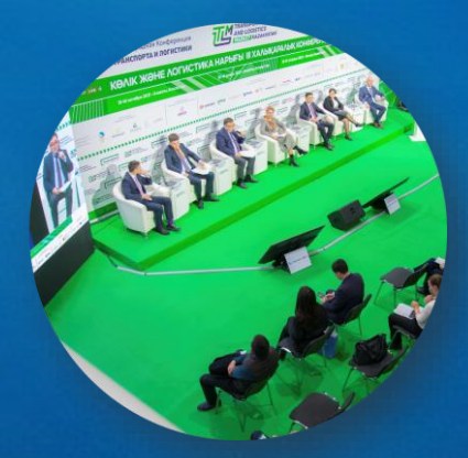
III INTERNATIONAL CONFERENCE "TRANSPORT AND LOGISTICS MARKETTING"