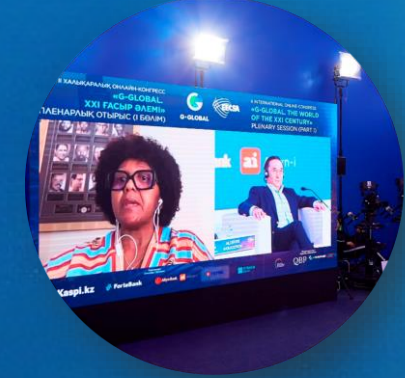
II INTERNATIONAL ONLINE CONGRESS "G-GLOBAL. THE WORLD OF THE XXI CENTURY