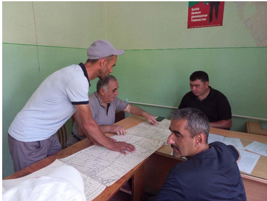
Photo 1: National experts brainstorming the demo project's implementation

Due to the mountainous landscape over 50% of the irrigational land of Tajikistan requires the support of the pumping stations. Annually about 1.5 bln kWh of hydro-generated electricity is consumed by the pumping stations. Out of which about 1 bln kWh comes only for Sughd Province as it is located in the lowland of Syr Dariya River. The outdated irrigational infrastructure (40.6%) fails to deliver the high-quality service to the end user as dekhan households that reflects on the low collection rate for water transfer fee (below 80%). Annually, electricity bills makes 118 million somoni (11 million EURO), the fee received from the water users makes around 40 million somoni (around 3,8 million EURO). The difference between the bill and collected amount is charged by Barki Tojik as a debt to the Agency for Land Reclamation and Irrigation under the Government of the Republic of Tajikistan (ALRI). For the first quarter of 2022, debts for used electricity have been accumulated for the amount equal to 364 million somoni (34 million EURO) that ALRI cannot repay and remains in debt to Barki Tojik. Although, back in 2014 and 2018, the Government already written off the debts for the electricity bills of ALRI to Barki Tojik in the